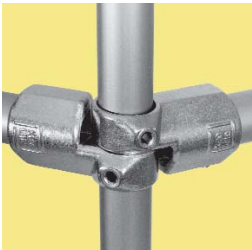
L19 Adj. Side Outlet Tee