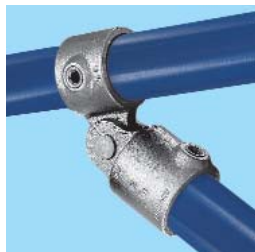
C50 Single Swivel Socket