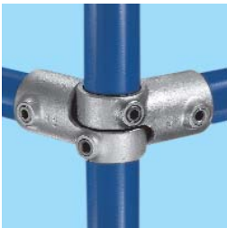
19 Adj. Side Outlet Tee