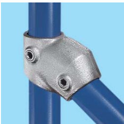
29 30° to 60° Socket Tee