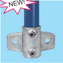
115 Wall Flange