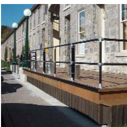
40 Page Catalog Available