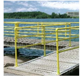
Rugged and Durable