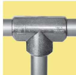
L25 Three Socket Tee