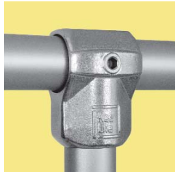
L10 Single Socket Tee