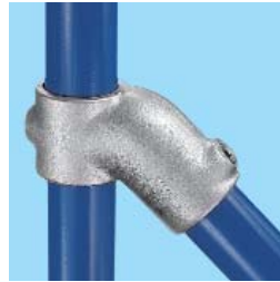
12 45° Single Socket Tee