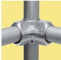
L21 90° Side Outlet Tee