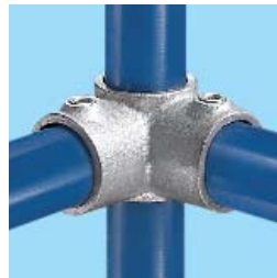
21 90° Side Outlet Tee