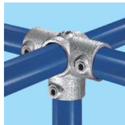
35 Three Socket Cross