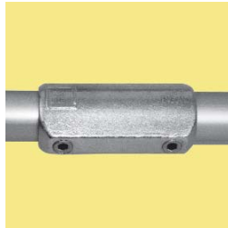
L14 Straight Coupling