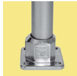
L152 Square Base Flange