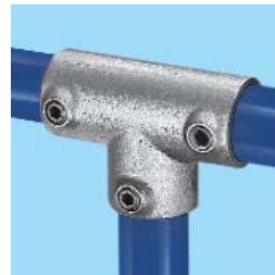
25 Three Socket Tee