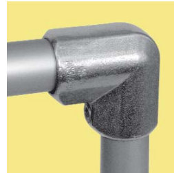
L15 90° Elbow