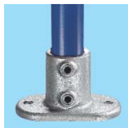
62 Standard Railing Flange