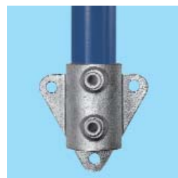
68 Wall Flange