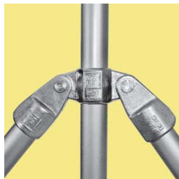
LC51 Double Swivel Socket