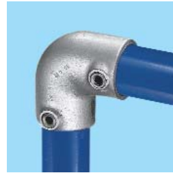
15 90° Elbow