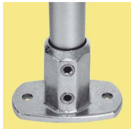
L62 Standard Railing Flange