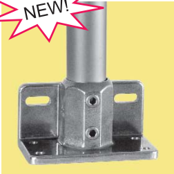
L69 Flange/Toeboard Adapter