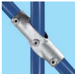
30 30° to 60° Adj. Cross