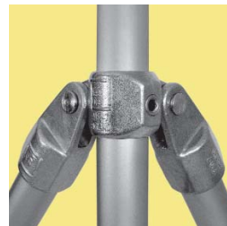
LC52 Corner Swivel Socket