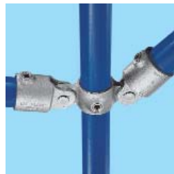
C51 Double Swivel Socket