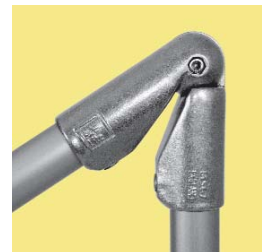
LB54 45°-200° Swivel Elbow