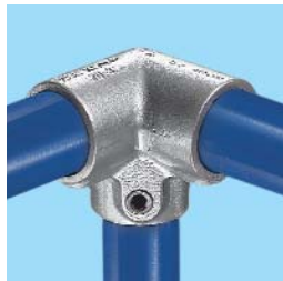
20 Side Outlet Elbow