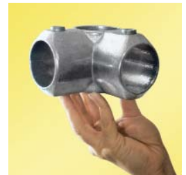
Full Catalog Available

High grade aluminum silicon magnesium alloy withstands corrosive environments. Lightweight yet durable, Kee Lite aluminum fittings have a wide range of use in various environments including water treatment facilities, industrial plant safety, retail spaces, interiors, recreation, and theatrical and entertainment. Designed for use with Schedule 40 pipe sizes 1" - 2".