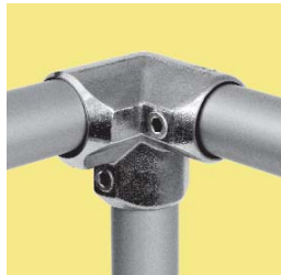
L20 Side Outlet Elbow