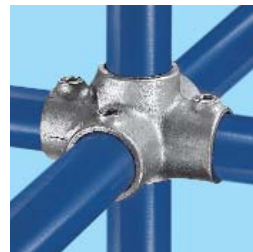
40 Four Socket Cross