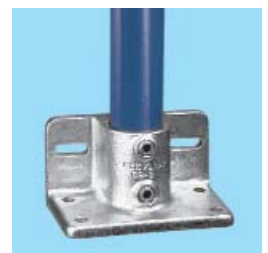
69 Flange/Toeboard Adapter

Kee Klamp fittings allow easy installation and provide a strong grip. The fittings have a wide application range including but not limited to handrails, safety barriers, guardrails, store fixtures, fences, awnings, bleachers, playground equipment, grid systems, and customer guidance. A hex tool is used for assembly. Fittings have case hardened set screws with Kee Coat™ protective finish and are galvanized for corrosion resistance with low long term maintenance. Kee Klamp is designed to fit Schedule 40 pipe sizes 1/4" - 2".