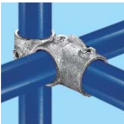
46 Socket Tee/Crossover