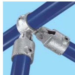
C52 Corner Swivel Socket