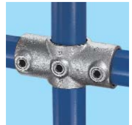
26 Two Socket Cross