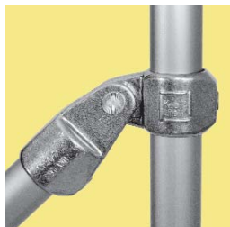
LC50 Single Swivel Socket