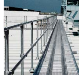
Easy System Integration