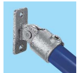
C58 Swivel Flange