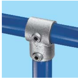
10 Single Socket Tee